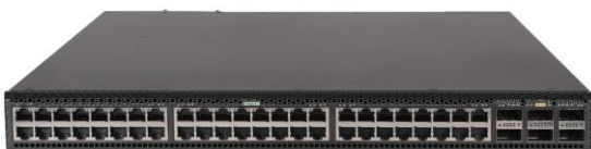
S6805-54HT front panel

The switch provides 48 × 10G Base-T ports, 6 × 100G QSFP28 ports.