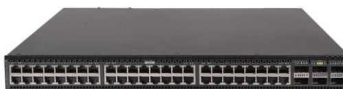
S6805-54HT rear panel